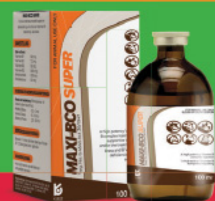
Vitamin B Complex Injection